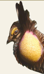
Attwater's Greater Prairie-Chicken once lived on the Katy Prairie