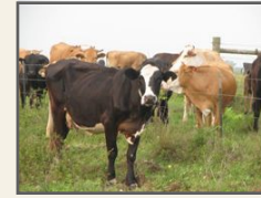
Farmland and Ranches