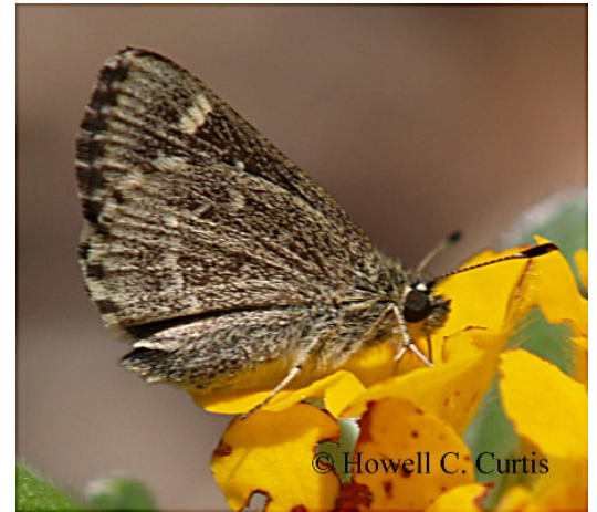
Salt & Skipper Skipper

Yellow Indiangrass is the larval food for the Salt & Pepper Skipper ( Amblyscirtes hegon ) on Louisiana's Cajun Prairie and is eaten by rabbits, cows, and rodents. It is also used for nesting material by many birds.