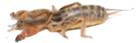
SOUTHERN MOLE CRICKET