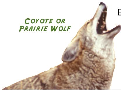
COYOTE OR PRAIRIE WOLF

Experience life as a wild dog by trying to sniff out prey, find your place in your "wolf pack", and even discover why a wet nose is better than a dry one!